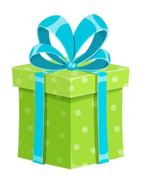
Topic: Birthday Party